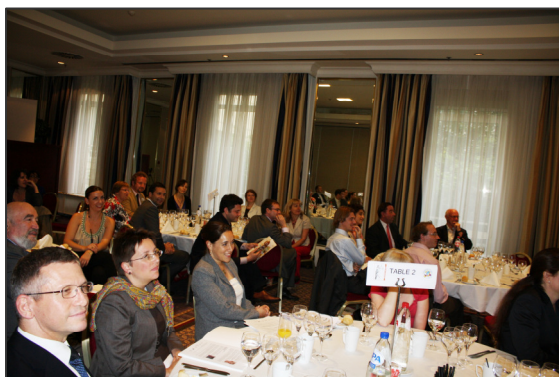
Members of the Jury